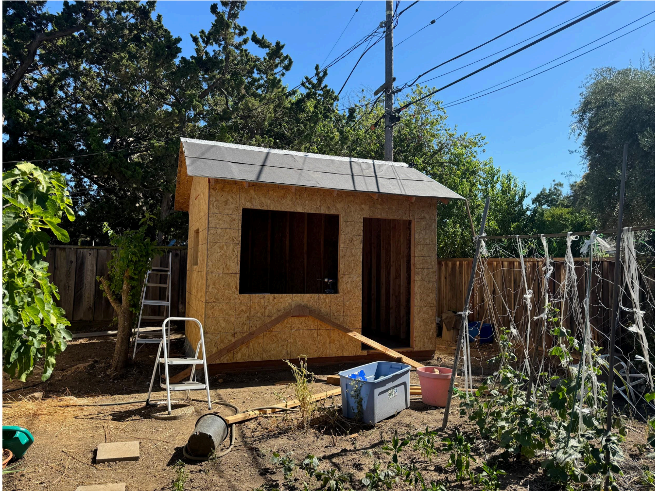
Figure 6: Installed Roofing Felt and prepped for shingles