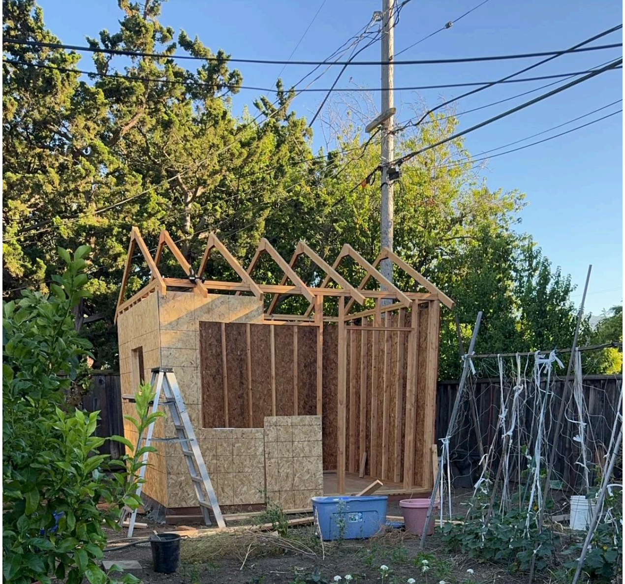
Figure 5: Installed Roofing Frame and began siding the walls with plywood