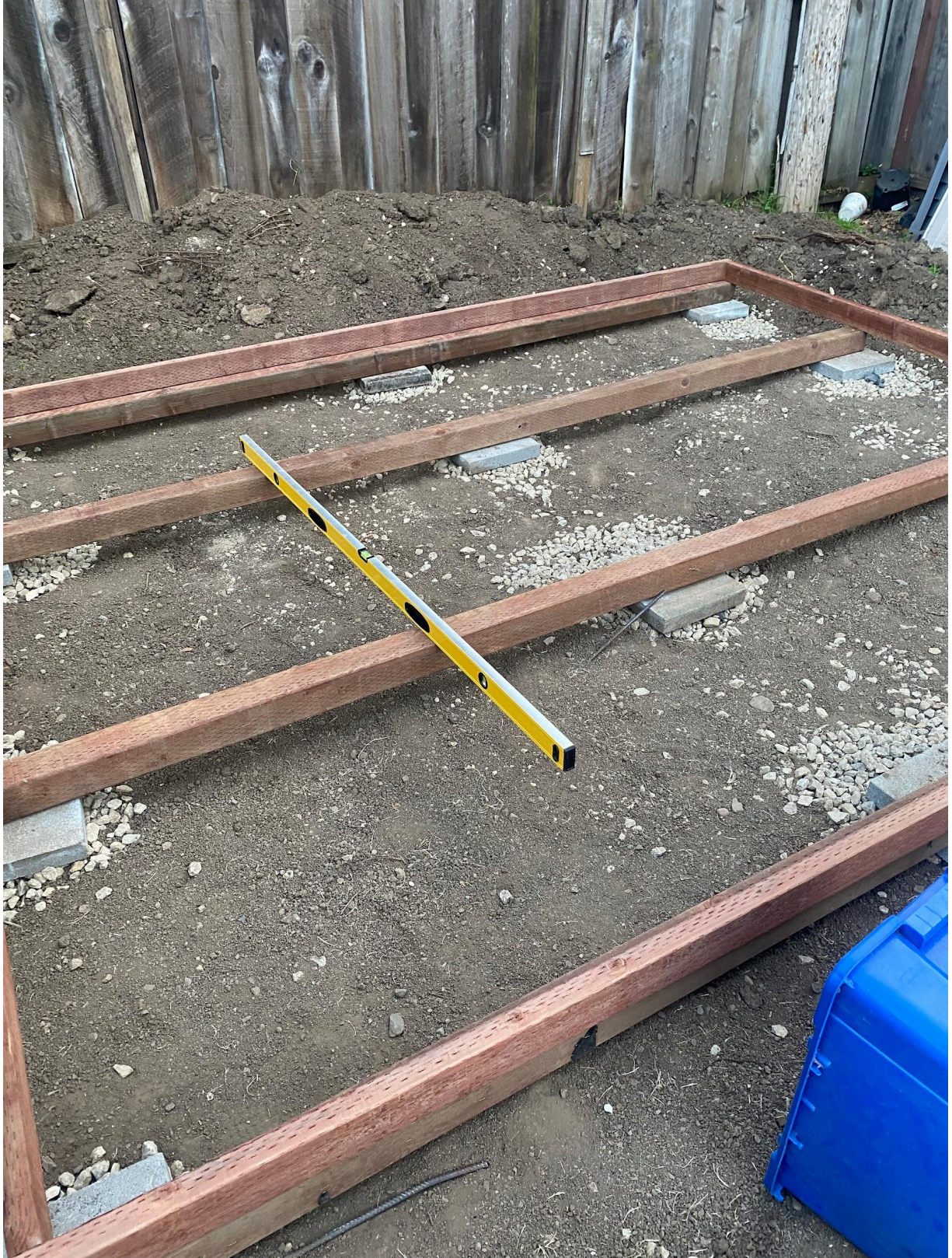
Figure 1.3: Continued Base, 4 cross beams, each supported by a 6 in gravel base and cement block