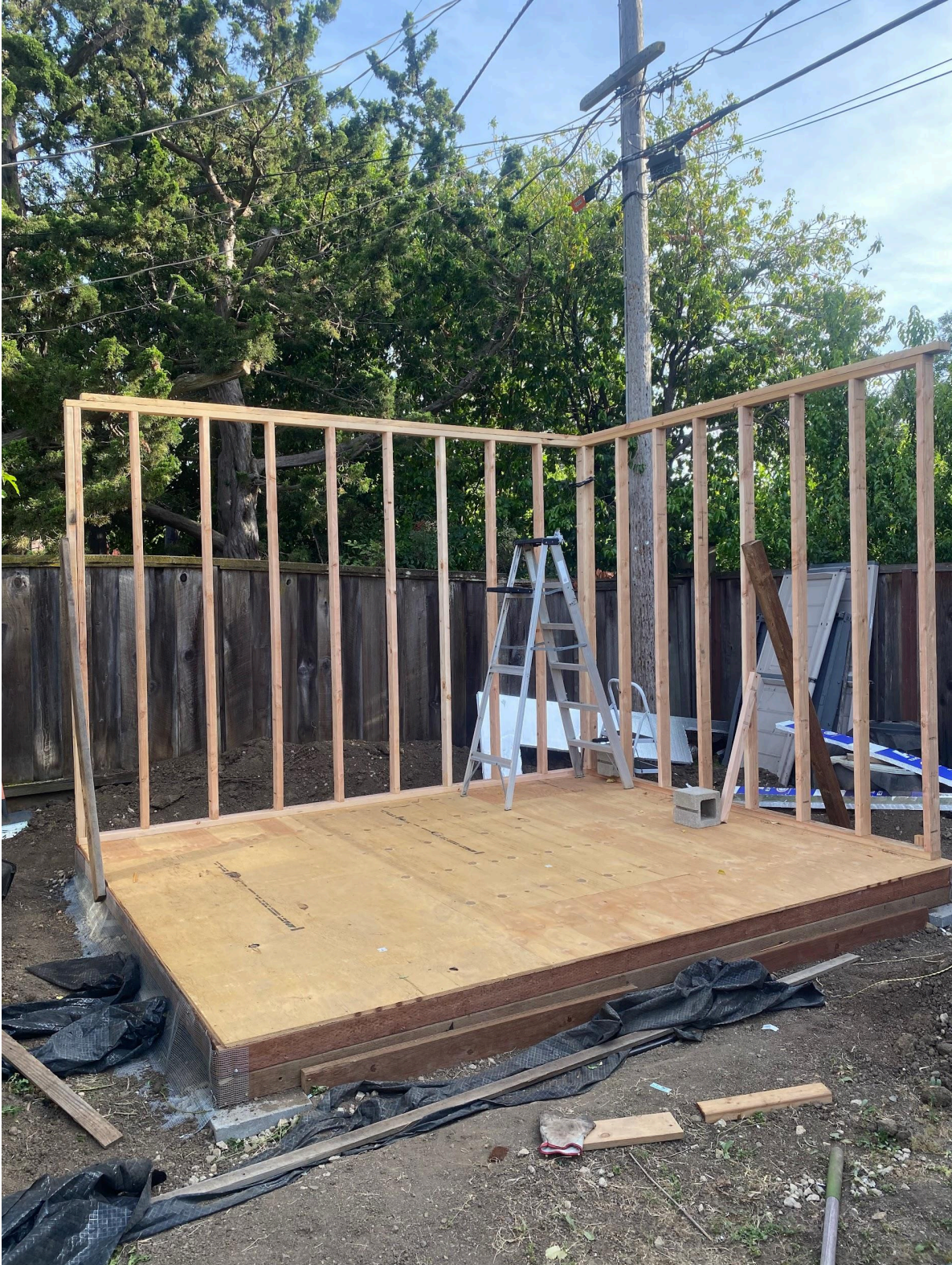
Figure 2: Installed Insulation under OSB board and wired/boarded edges for rodent protection. Added two of four frames