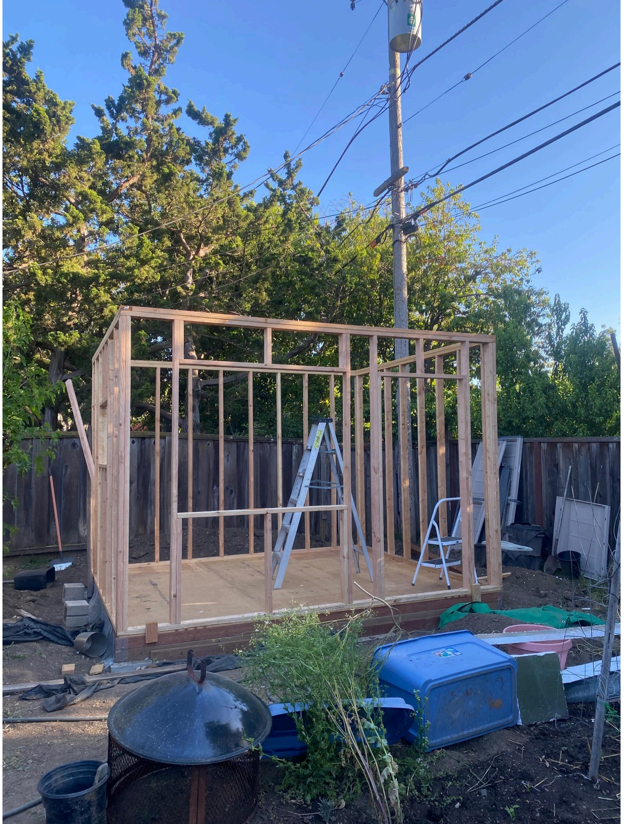
Figure 4: Installed 4th Frame