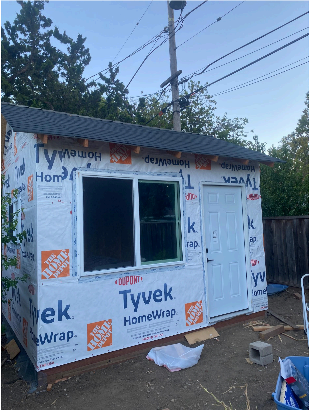
Figure 8: Installed all windows/doors with Tyvek weather wrap