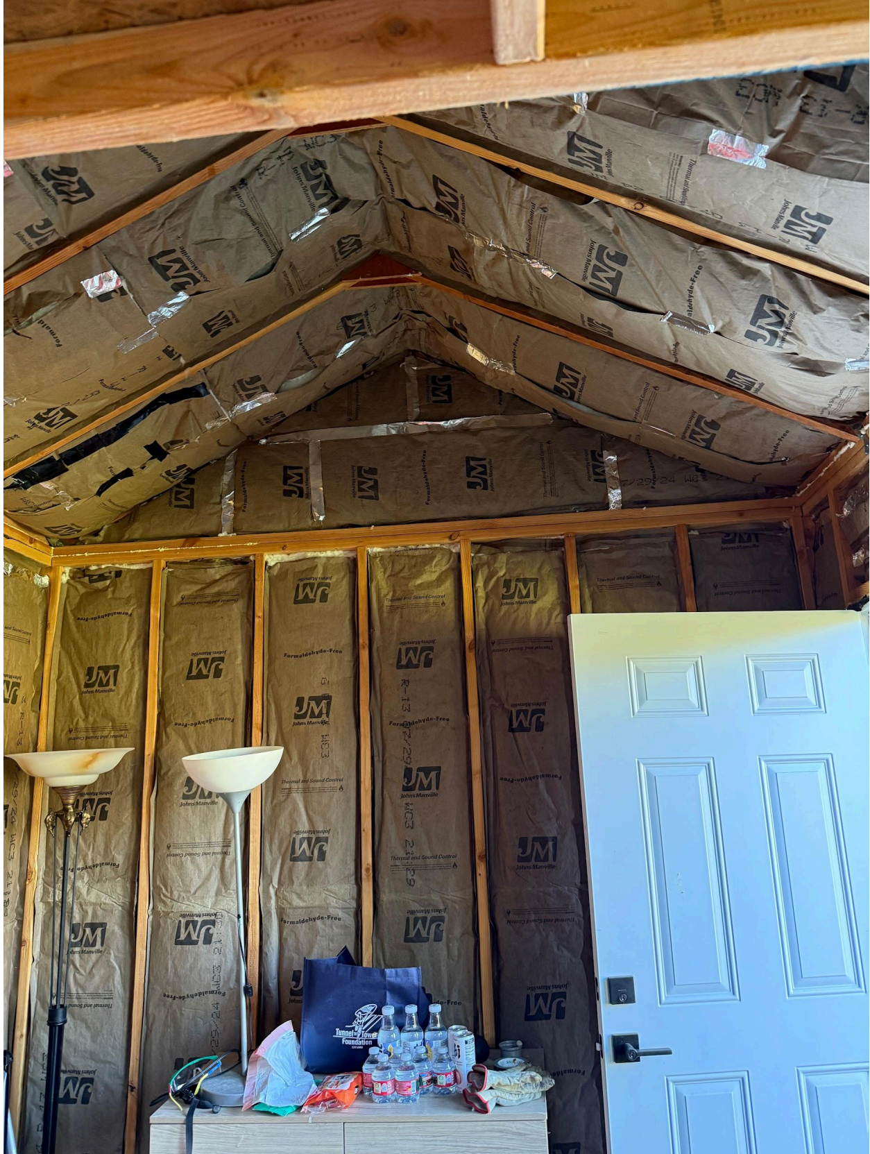
Figure 9: Interior Insuation Right side