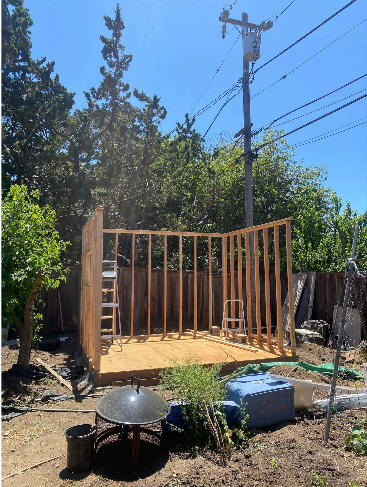
Figure 3: Installed 3rd Frame