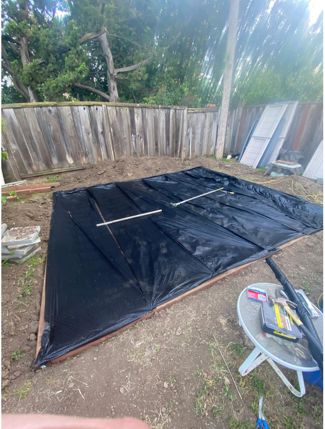
Figure 1.1: Initial Base of Shed