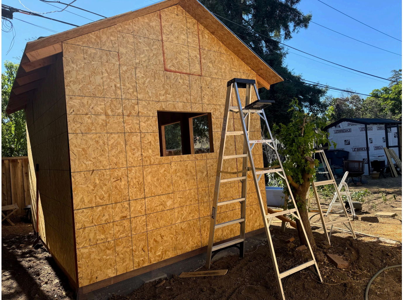
Figure 7: Side view of all plywood siding