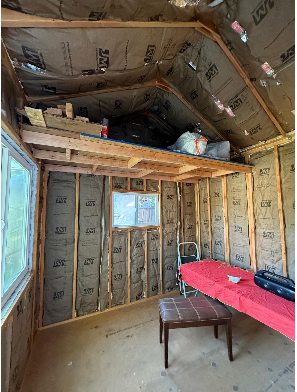
Figure 10: Interior Insulation Left Side