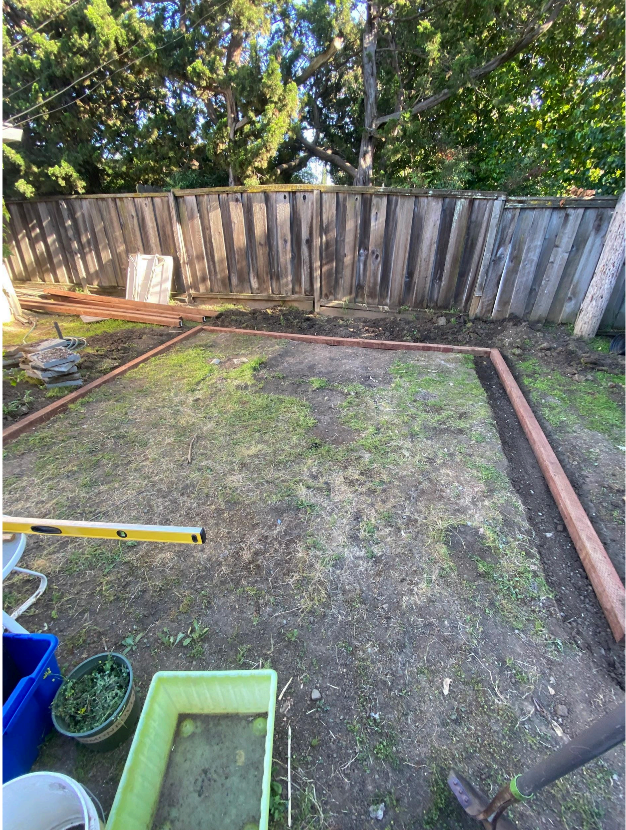
Figure 1.2: Revised Base, gravel base was too expensive (approx $1000)